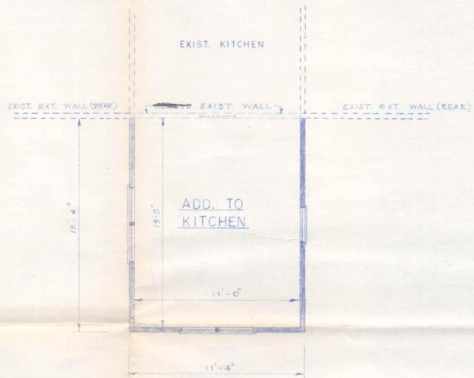
FLOOR PLAN SCALE: 1/4" = 1'-0"